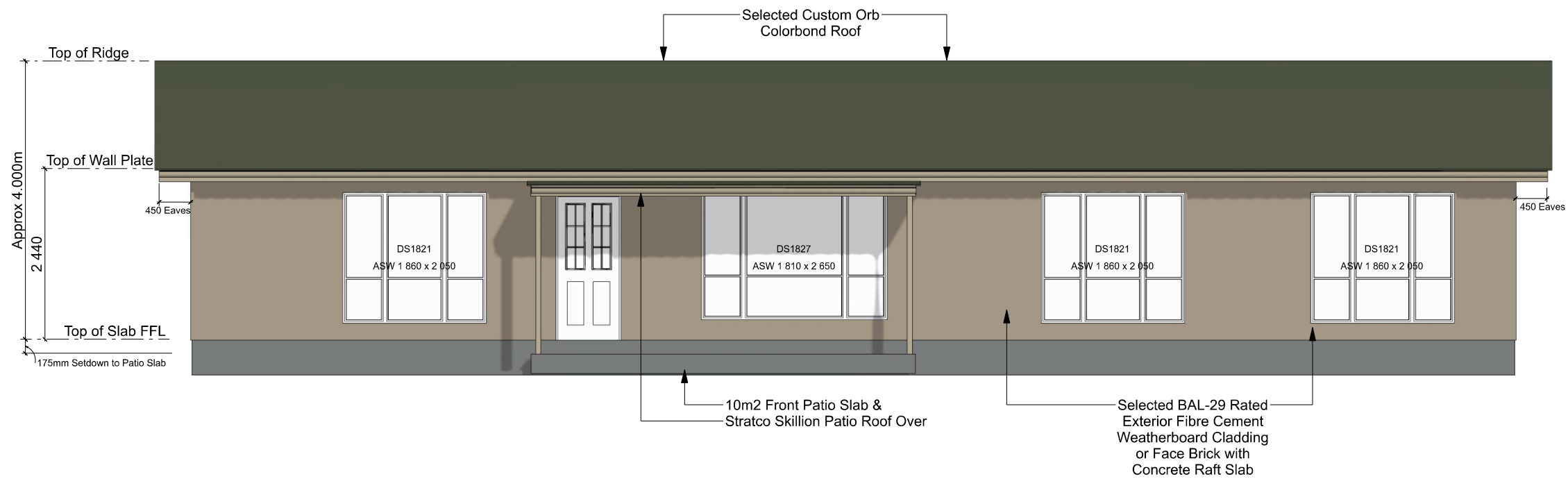
FRONT ELEVATION - 4 - 5 Bedroom - 192m2 - Residence with Ensuite SCALE: 1:75